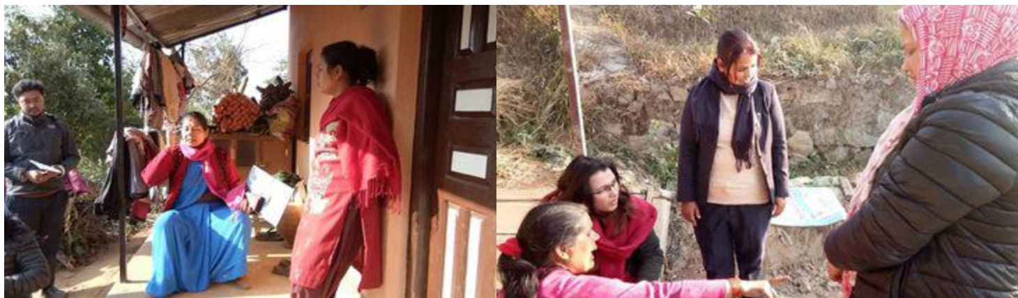
Photos above from a monitoring visit from Mahalaxmi Municipality